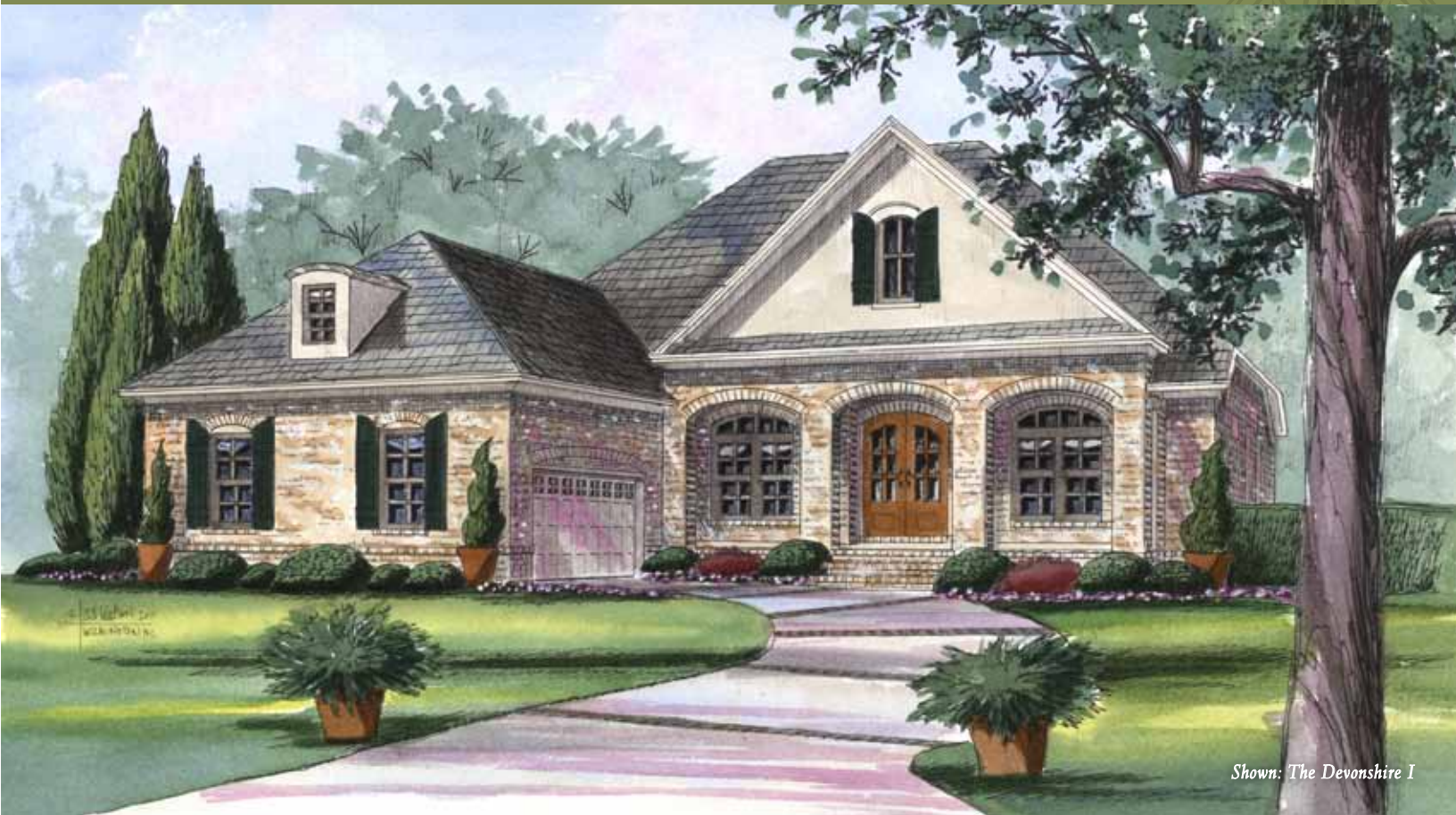
Shown: The Devonshire I