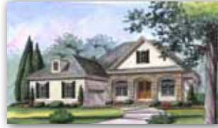
The Devonshire II

KENT select A SMARTER WAY TO A LUXURY HOME