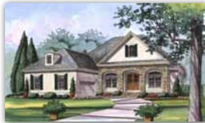
The Devonshire II

KENT select A SMARTER WAY TO A LUXURY HOME