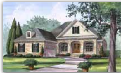
The Devonshire I

The Devonshire is a bold, European inspired floor plan with 3 Bedrooms, 2.5 Baths and a Study, comfortably nestled within a generous 2,667 square feet. The Kitchen and Entertaining Island are positioned perfectly to make the most of entertaining opportunities and mingle space with the roomy Great Room. The Great Room flows seamlessly to the Screen Loggia through expansive 12' telescoping doors, allowing for an easy transition from outdoor to indoor entertaining. The split floor plan provides exceptional serenity in the Master Suite. The Master Suite features his and her closets, coffered ceilings and a Master Bath you may not want to ever leave. The Master Bath features a walk-in shower, large soaking tub, dual vanities and convenient access to the Laundry.