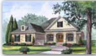
The Devonshire I